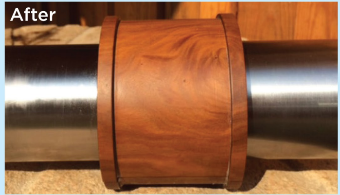
Highest Ranked Environmentally Safe NSF-61 Bearing